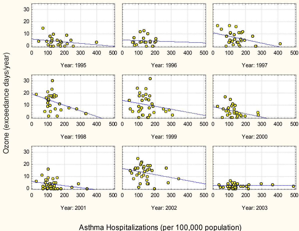
Figure 3. Asthma Hospitalization Rate vs. Ozone Level for N.C. Counties

Notes: Ozone exceedance days are based on the 8-hour ozone standard.