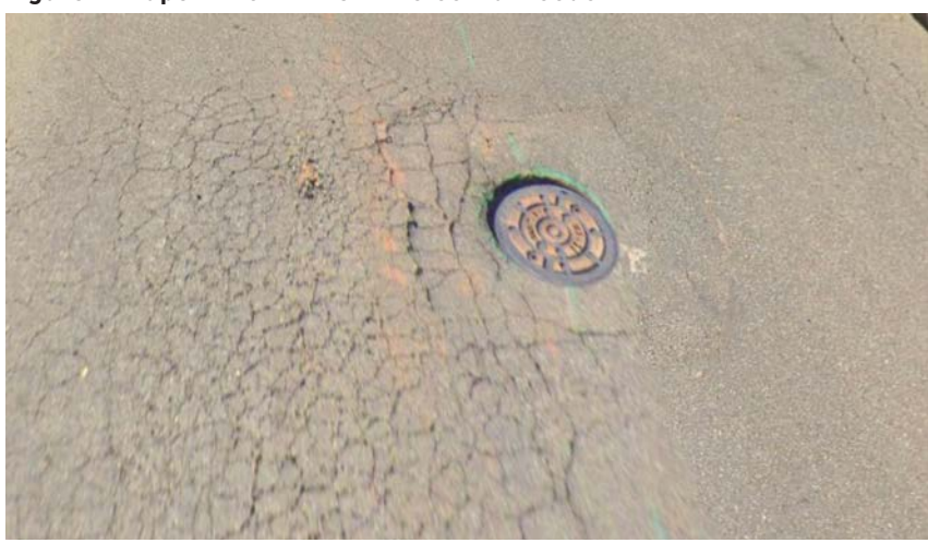
Figure 2: Paper Birch Drive in Holcomb Woods.

This image is taken from the NCDOT's map of state maintained roads and shows an area south of Harrisburg. Colored lines show roads maintained by the state; roads that are not maintained by the state are shown in white. Part of the upper left corner of the map is inside the Harrisburg city limits, but the rest of the map is outside of any city boundary.