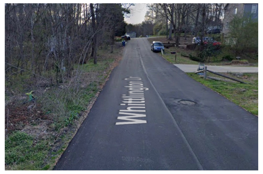
Figure 3: Whittington Drive in an older neighborhood northwest of Holcomb Woods

For example, Figure 2 shows a portion of Paper Birch Drive in Holcomb Woods. The pavement is heavily cracked, and the area around the utility cover has sunk. Figure 3 shows that Whittington Drive in the older neighborhood appears to have been recently sealed. It is in good condition, and there is no sign that the pavement around the utility cover is sinking.