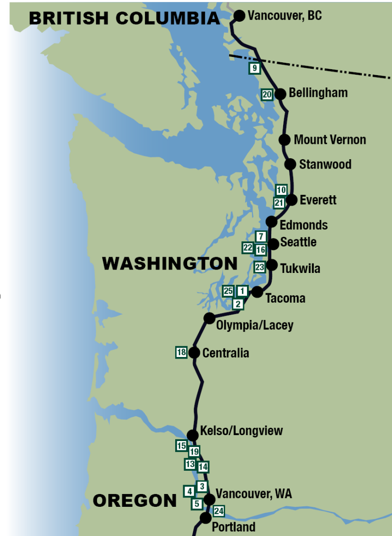
Projects that Span the Corridor 6 8 11 12 17