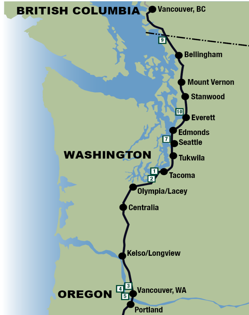
Projects that Span the Corridor 6 8 11