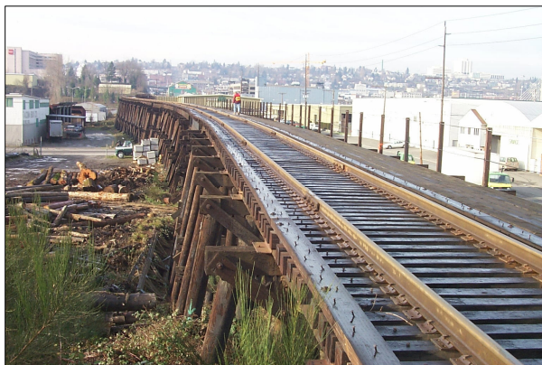
Tacoma Trestle from the North

This project, estimated to cost $125.4 million, would design, permit, purchase necessary right-of-way, construct earthwork, and replace a 1910's era 1,700 foot-long timber trestle to accommodate two main tracks from Portland Avenue and Freighthouse Square. As part of the work, two bridges over city streets would be replaced and two main tracks installed and the signal