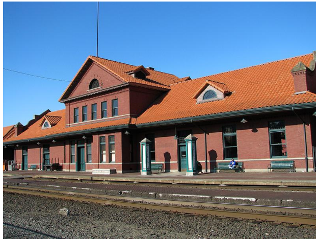
Centralia Station as it is today.

This project constructs a new eastside passenger second platform and passenger overcrossing at Union Station in Centralia. The station is located approximately half way between Seattle and Portland on the BNSF Seattle subdivision. The station is served by Amtrak Cascades and the Coast Starlight intercity rail passenger services. The latter rail service operates in California, Oregon, and Washington.