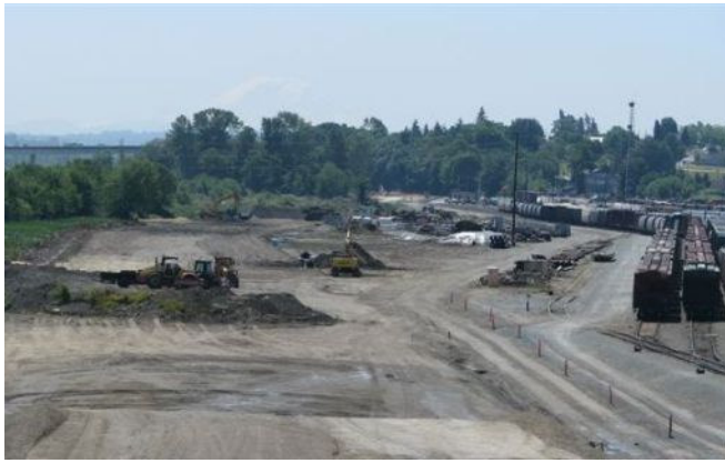
Grading work underway at Everett.

This project was identified through a capacity modeling and operations analysis as a location where freight interference often delays Amtrak Cascades trains. Without this project, these delays will continue, impacting on time performance. One of the Mid-Range Plan goals for the service is to improve overall on-time performance to over 90 percent, and this project will eliminate a major source of freight train interference to help achieve that goal.