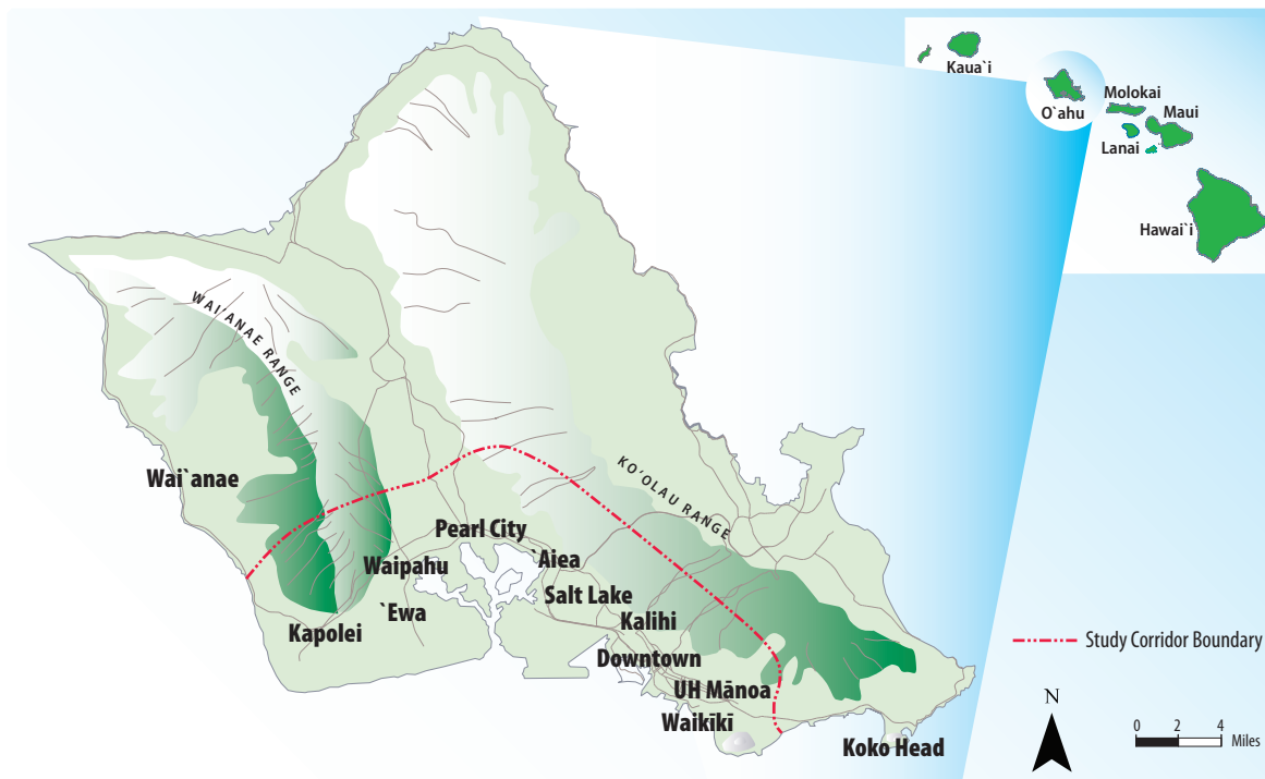
Figure S-1 Honolulu High-Capacity Transit Corridor Project Vicinity

can be achieved with buses operating in congested mixed traffic. It will provide reliable mobility in areas of the corridor where people of limited income and an aging population live and will serve rapidly developing areas of the study corridor. The HHCTCP will also provide additional transit capacity and an alternative to private automobile travel, as well as improve transit links within the study corridor. In conjunction with other improvements included in the ORTP, the HHCTCP will help moderate anticipated traffic congestion in the study corridor. It also supports the goals of the City and County of Honolulu General Plan (DPP 2002a) and the ORTP by serving areas designated for urban growth.